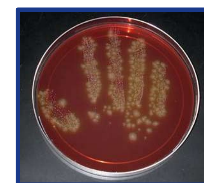
C. difficile on a gloved hand

Most reports of increases in the incidence and severity of CDI have been associated with the BI/NAP1/027 strain of C. difficile . This strain produces more toxins A and B in vitro than do many other strains of C. difficile , produces a third toxin (binary toxin), and is highly resistant to fluoroquinolones.